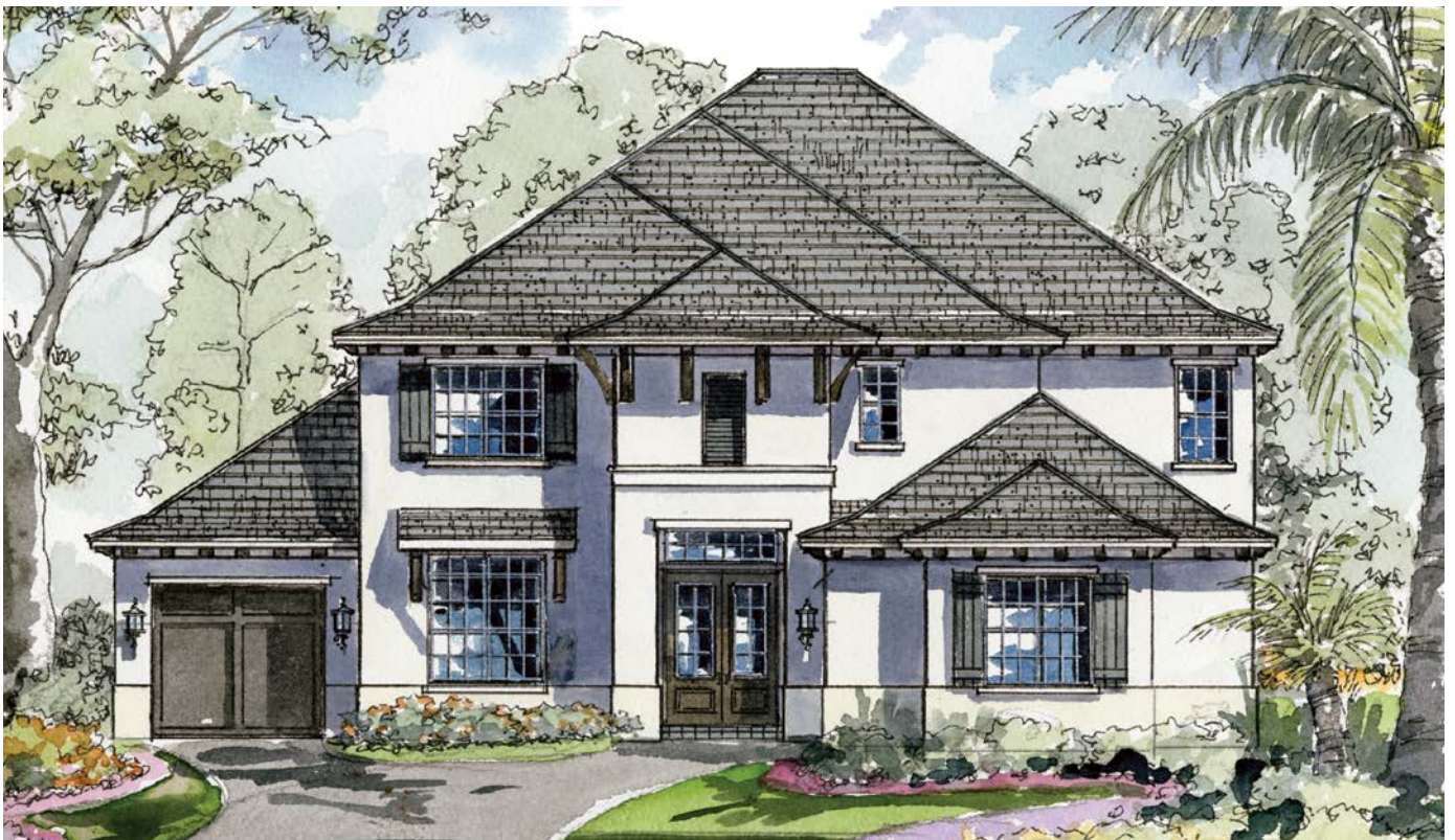
West Indies – Elevation C