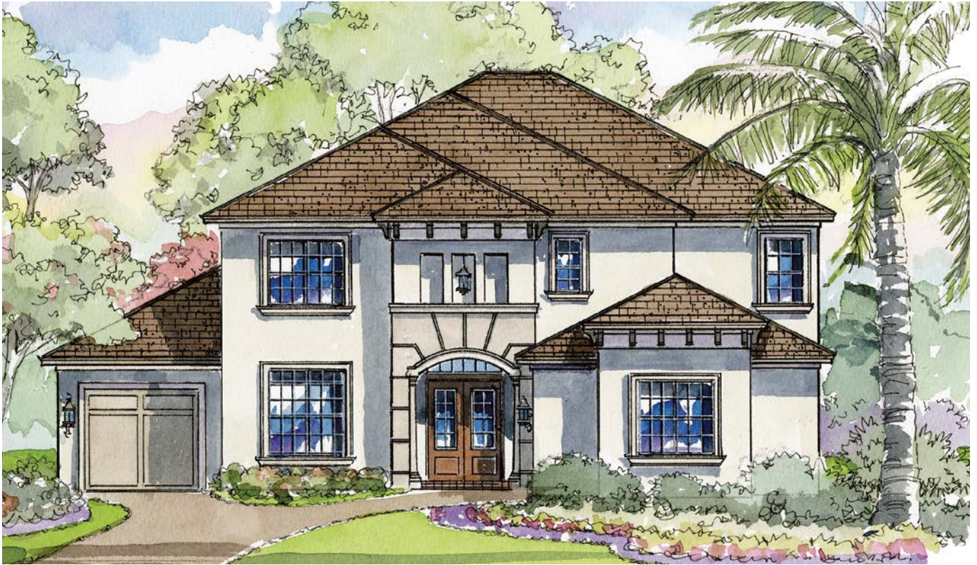
Mediterranean – Elevation B