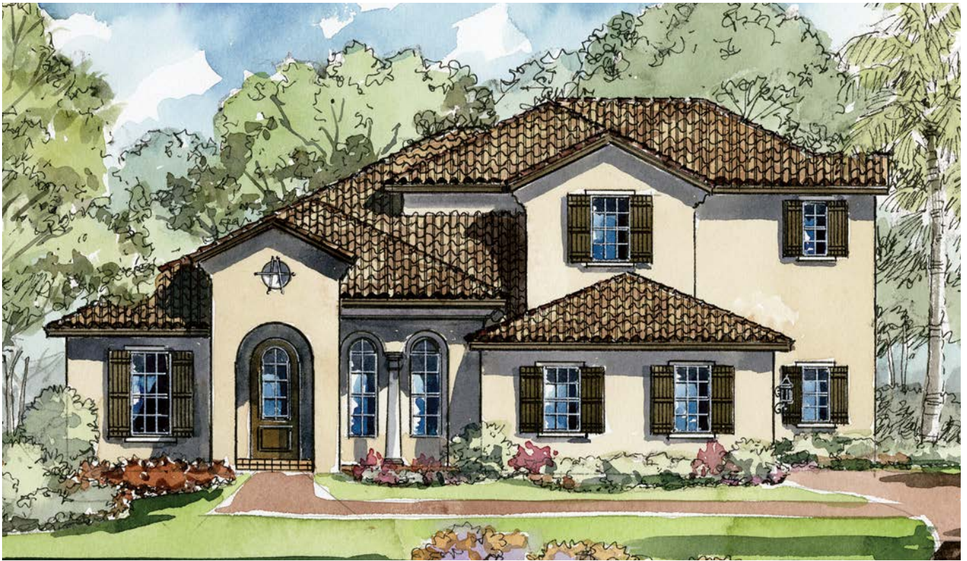
Craftsman – Elevation D