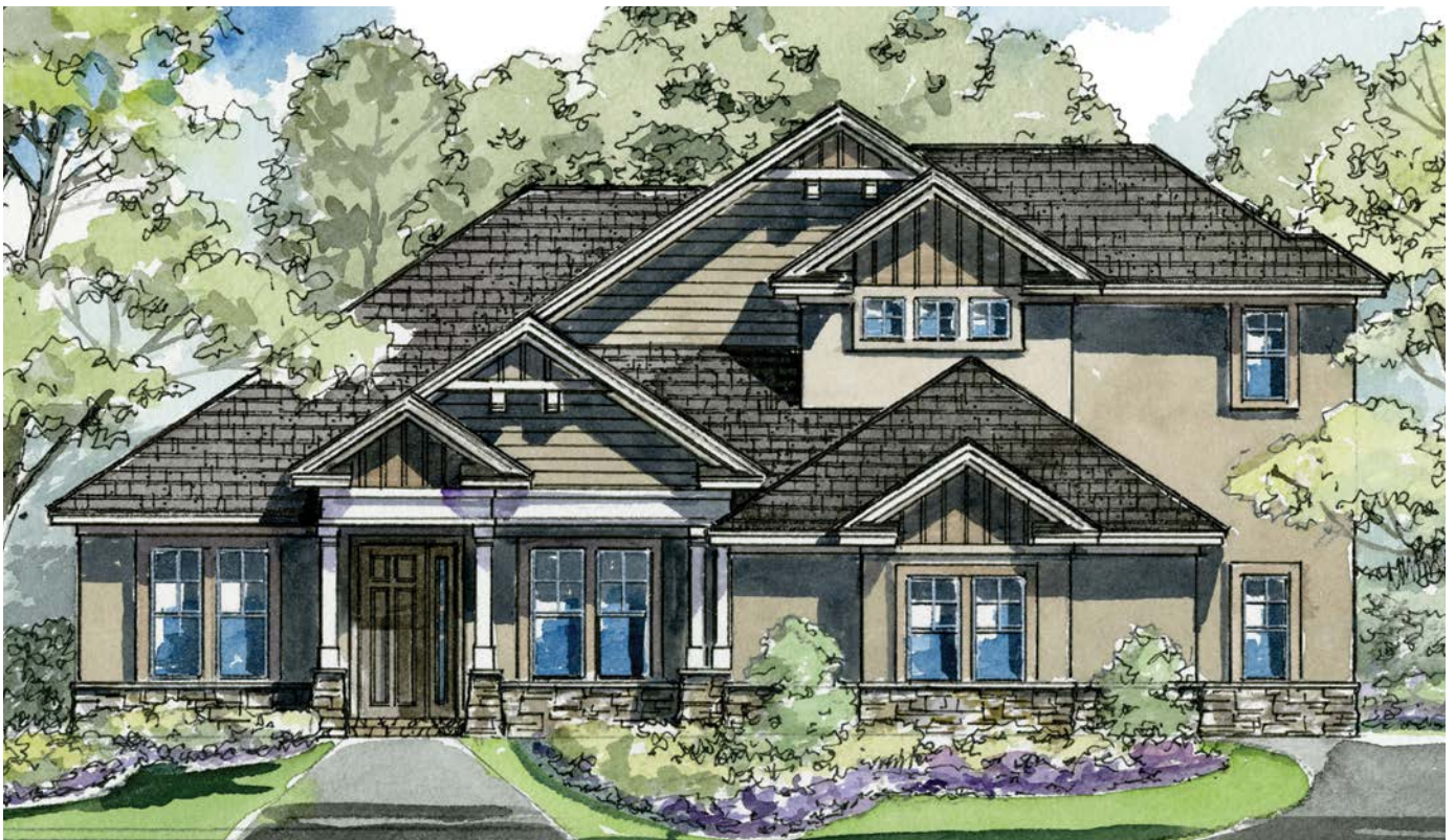
Craftsman – Elevation B